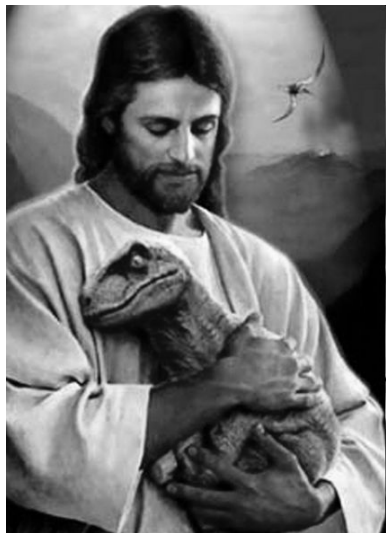
This photograph of Jesus holding a baby dinosaur proves that dinosaurs existed 2000 years ago!